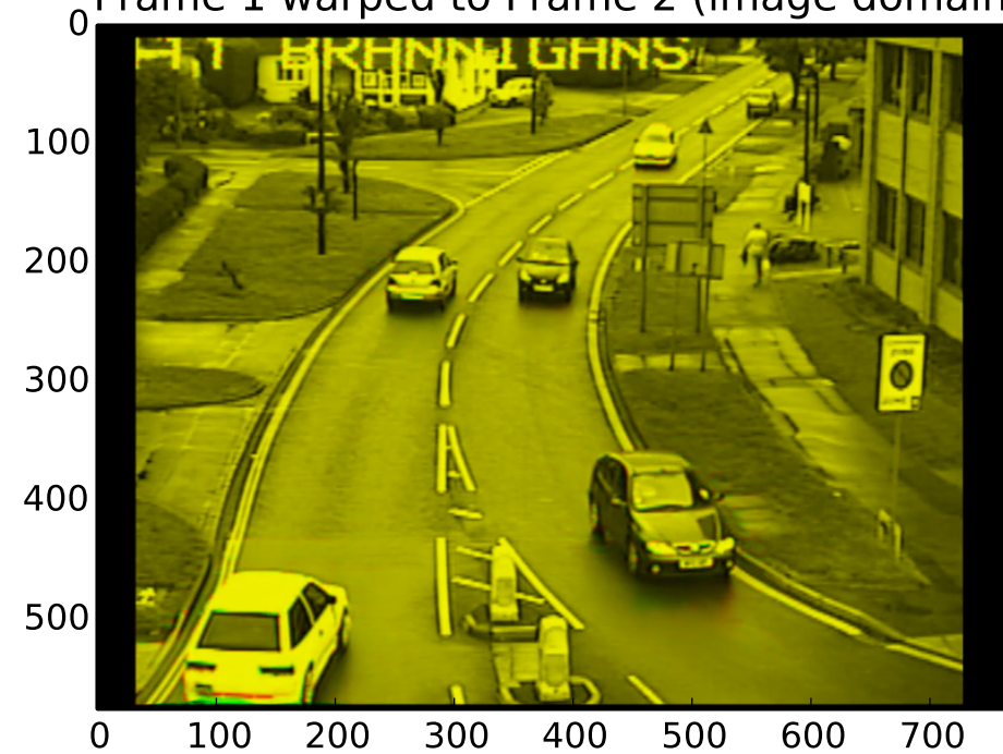
Frame 1 warped to Frame 2 (image domain)